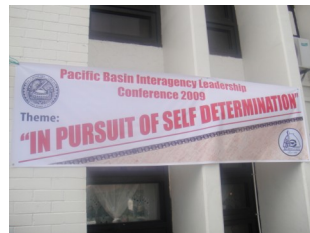
Conference banner posted in front of the ASCC building

The American Samoa Community College (ASCC) hosted the Pacific Basin Interagency Leadership Consortium Conference on Monday and Tuesday, January 11th and 12th,