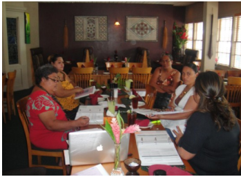
Orientation for new members for the UCEDD Advisory Council at Sadie's Inn in Fagatogo on November 2009

The UCEDD Advisory Council had their first meeting last November 2009 as to discussed various ways of how to improve the services to those who are in special needs. The Advisory Council composed of consumers, family members, educators, human services providers, and the public sectors. The Advisory Committee as-