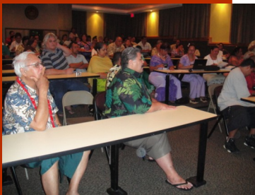
Chairman & ASCC President during the PBILC Conference at ASCC Lecture Hall

The PBILC Conference 2010 came into success because of support and help from our various departments within our ASCC. Special acknowledgements to the following individual, ASCC departments, and ASG Agencies/Departments for their endless support: