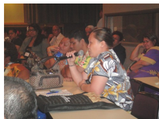
Participants asking questions during "Open Forum Discussions" in the Lecture Hall.