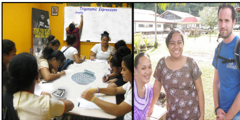
GUAS students on a task with an RTI