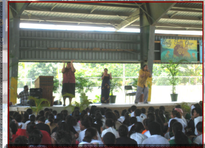
The GEARUP team performing at LHS.