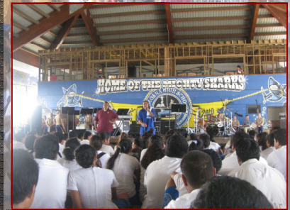
The GEARUP team performing at SHS.