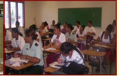
TAFUNA HS October Homework Session