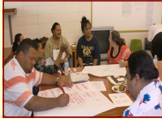
FAASAO MARIST HS August Teacher Orientations