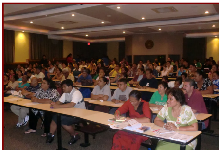
More than 180 GUAS parents, students and teachers participated in the GUAS College Night.