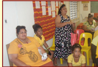
NUUULI VOC TECH HS September Teacher Orientations