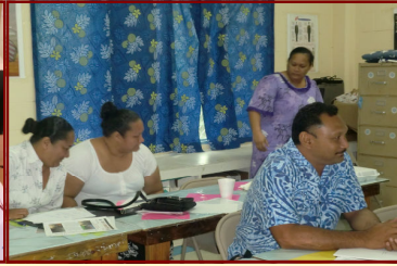
KANANA FOU HS August Teacher Orientation