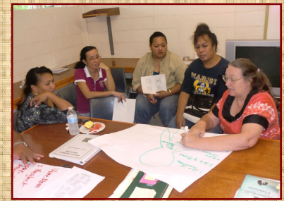
Faasao teachers work on an activity during a session with DHSS.

The overall feedback from teachers was positive. Teachers commented that an alignment of curriculum to standards was an effective strategy to help students do better on standardized tests such as the SAT, and even locally designed tests such as the SBA tests.