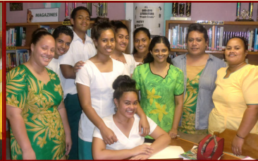
LEONE HS September PD Sessions