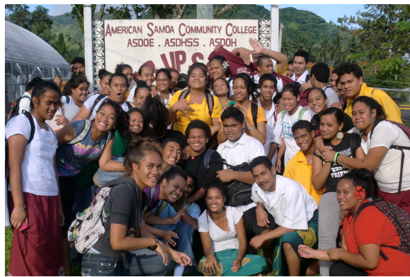
A Group of RTI students who enjoyed different sessions provided by the GEAR UP RTI Math Intervention Program.