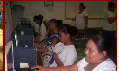
LAKINA ADVENTIST ACADEMY October PD Session