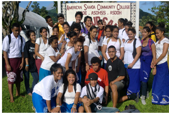
A Group of RTI students who enjoyed different sessions provided by the GEAR UP RTI Math Intervention Program.