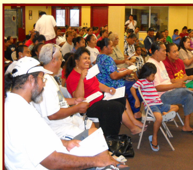
Parents of Tafuna High School joined the activities by the GUAS staff during a Wrap Around Service.