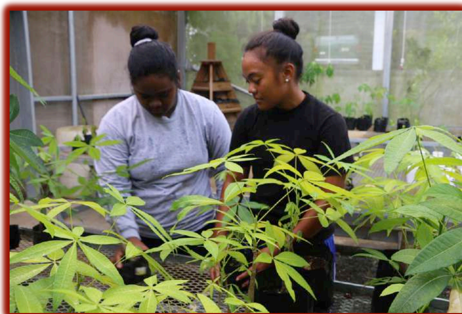
Nu’uuli Vocational Technical High School students in the School to Work Program working in the ACNR Fruits for Life Greenhouse.