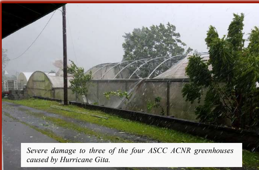
Severe damage to three of the four ASCC ACNR greenhouses caused by Hurricane Gita.

ASCC ACNR researchers gave a big sigh of relief in the aftermath of Hurricane Gita's impact on the Samoan islands. The ACNR research building and labs, including the newly refurbished roof, came through largely unscathed. The ACNR generator was able to maintain power to all the labs, including all the plant and insect growth chambers and freezers and refrigerators holding critical research materials. ASPA power and ASTCA phone and internet service was restored to the facility after only a day and a half of downtime. The research greenhouse and insectary in the back of the Land Grant station remained intact and required only minor repairs. The ACNR horticulture research program conducts much of its research in field plots on farmers' lands, and some of those plots were damaged. An ASCC ACNR taro variety trial in Taputimu was damaged when the roof of a nearby house was blown off and landed on top of the taro field. A newly planted tomato variety trial was also destroyed by the strong winds. Wind gusts up to 59 mph were recorded by a weather station located at the plot. Though recovery will take some time and a lot of work, and some research was lost in the storm, the researchers are grateful, as they are well aware that things could have been much worse.