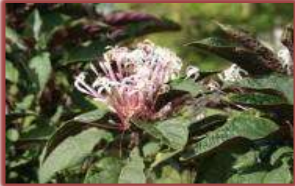
( Clerodendrum quadriloculare , Laau vili taliga (Q-Tip))

Forestry staff found invasive species such as ' Clerodendrum paniculatum ' (faleo'o) and ' Clerodendrum quadriloculare ' (Q-Tip) in the residential areas of Ta'ū. Approximately 0.5 acres are infested with the above invasive species. Invasive species destroy native species and negatively impact the forest ecosystems and biodiversity. Landowners requested assistance from ASCC-ACNR in the control of the invasive species. As a result, Forestry staff will include invasive species control in the next trip to Ta'ū.