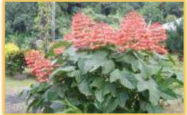
( Clerodendrum paniculatum , Faleo'o)

Additionally, staff followed up on ' Castilla elastica ', (pulumamoe) and observed a re-growth of about 16 seedlings at the old Ta'ū airport area. More than three ' Piper auritum ', 'Ava Toga', were also identified in Ta'ū, near the Tagaloa family residence adjacent to the American Samoa Government Building. Forestry staff made arrangements with the landowners to assist with a control work plan for FY 2018.