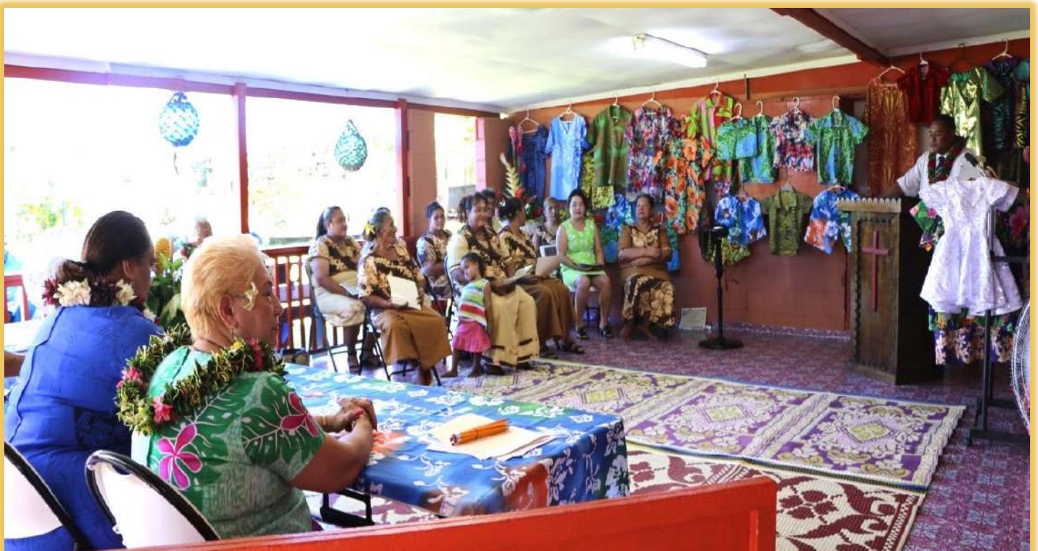
(The FCS Program's "Basic Sewing" workshop graduation for the "Lokou o le Ola" Baptist group in Leone.)

Prior to enrollment into the sewing course, ten female clients owned sewing machines but were not able to use the full function of the machines. However, at the end of the course, all ten clients were comfortable with using the sewing machine. About 90% of the clients requested more sewing program workshops, especially in learning how to sew suits.