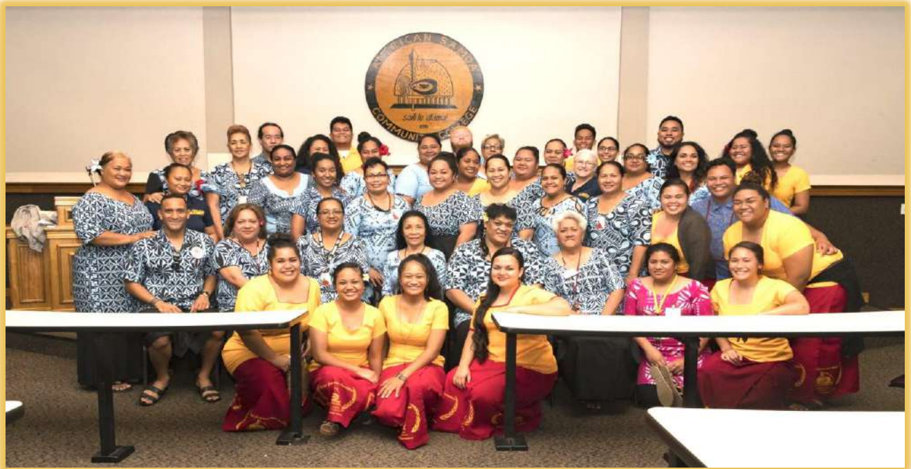
The staff of the ASCC Department of Student Services (DOSS) recently participated in a professional training workshop, along with the College's Student Government Association (SGA), who joined them in this combined DOSS/SGA photo.

The Division of Student Services (DOSS) at the American Samoa Community College (ASCC) conducted a professional training workshop in late November for the various campus offices, which come under its purview. DOSS encompasses the offices of Admissions, Records, Financial Aid, Counseling, Library Services, and Student Support & Learning Services, all of which serve students' needs as vital components of college attendance. DOSS also oversees the ASCC Student Government Association (SGA), which, among its many activities, serves as the primary link between the College's administration and its student body. The two-part training, conducted in the College's Lecture Hall, focused first on Customer Service and second on bringing the DOSS staff up to date on the services provided by the ASCC Library. Read the full article on ASCC's Website at http://www.amsamoa.edu/pressreleases.html or click on the following link: [Access Link]