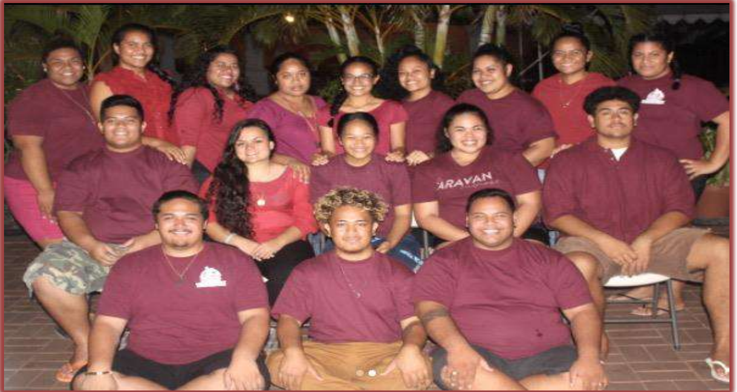
ASCC Student Government Association (SGA) 2017 - 2018