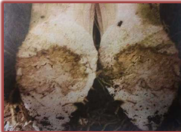
(Taro Corm Rot)

ASCC-ACNR and ASDOH visit taro plantations on Ta'u, Manu'a Islands: At the request of the American Samoa Department of Agriculture (ASDOA) Director, the ASCC-ACNR Entomologist and Horticulturist assisted ASDOA staff with a visit to Manu'a to assess taro varieties, pests and diseases in the Ta'u village Taufusi taro plantations and other areas of Ta'u Island. Recommendations were made to taro farmers on ways to control the diseases present in their plantations.