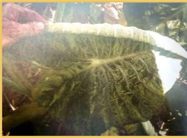
(Possible symptoms of Taro vein Chlorosis Virus)