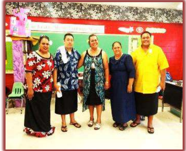
Level 7 teachers who are all ASCC graduates.

November 28, 2017: Lau Gagana Prize Giving – Short story writing in Samoan and stories by the winners are read on ASCC–SSI Faasamoa Pea Radio Program on KSBS 92.1 FM.