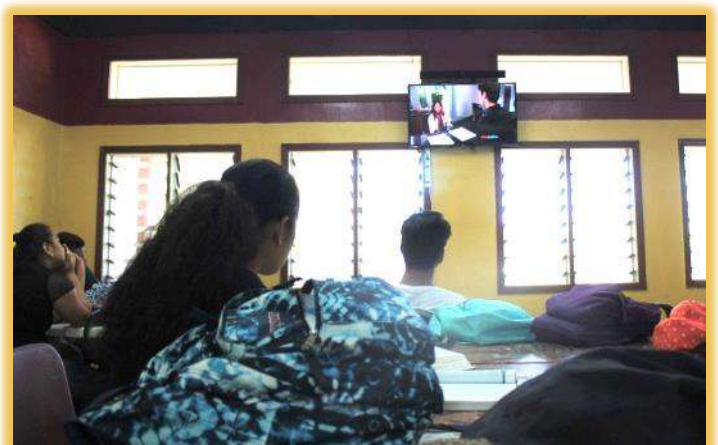
Students enjoy watching the TV in the cafeteria.