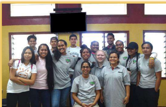
The Fresh Print Club students pose in front of the television in the cafeteria.

New addition in the ASCC Cafeteria – The newly installed TV, donated by the Fresh Print Club for students to enjoy in the cafeteria while taking a break from their classes.