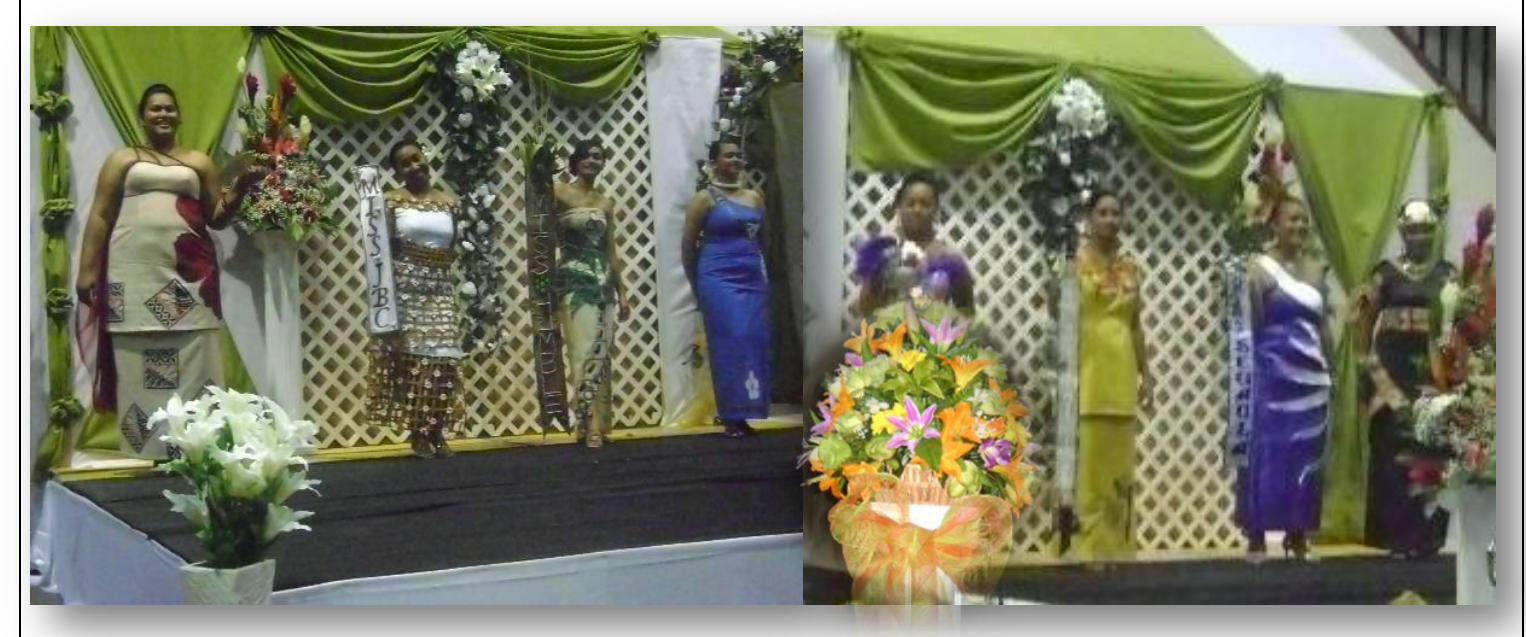
Also, Congratulations to the category winners of:

To ALL our ASCC Contestants!! Great job girls