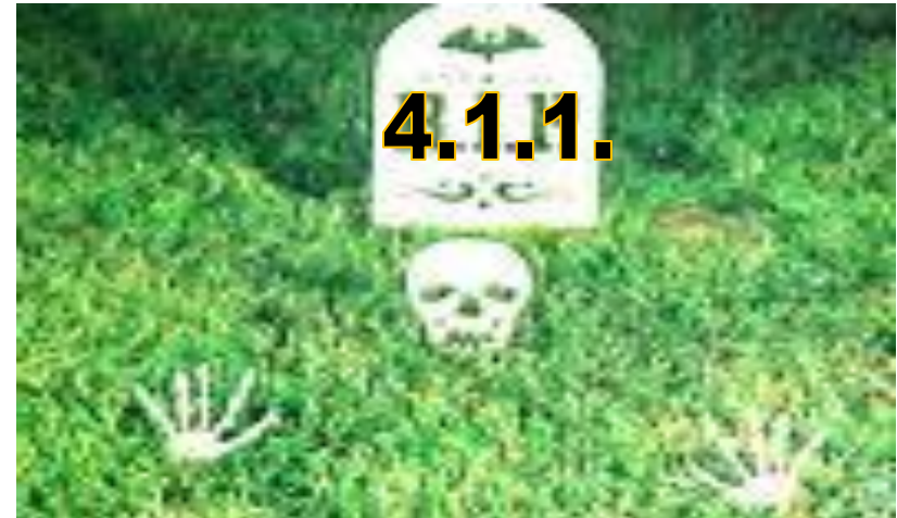
Weekly Information Bulletin "Connects Students to What is Happening On Campus" October 26, 2009 to October 30, 2009