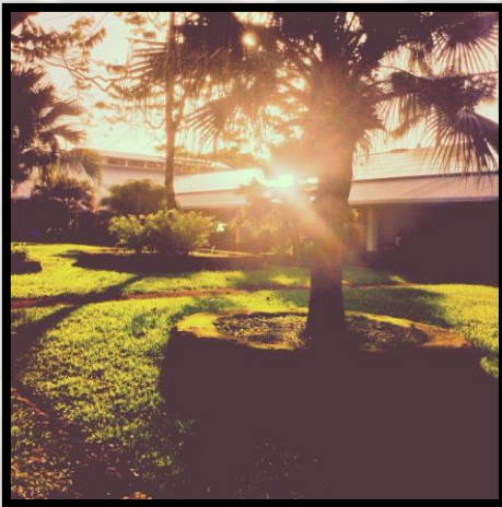
"Good morning ASCC"