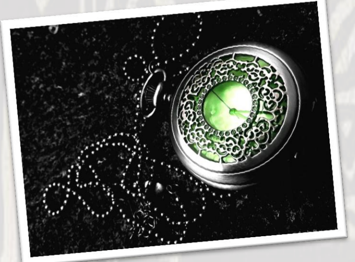
"The Power of Time"

Love is rare Love is blind Love isn't a game of truth or dare Leaving you caught in a ball of twine.